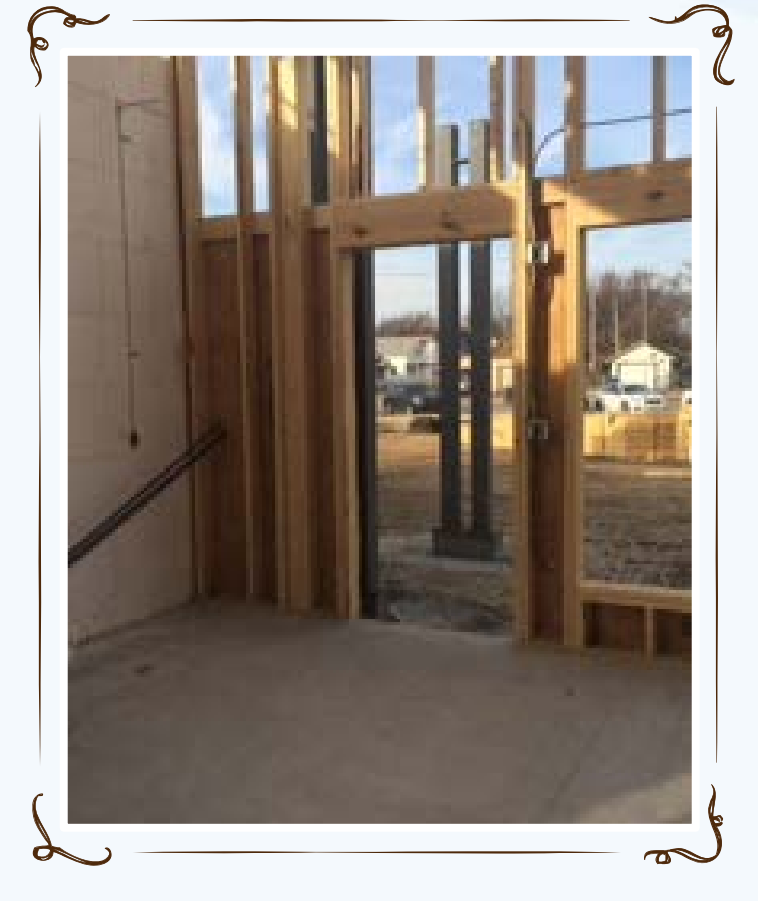
Walls going up.