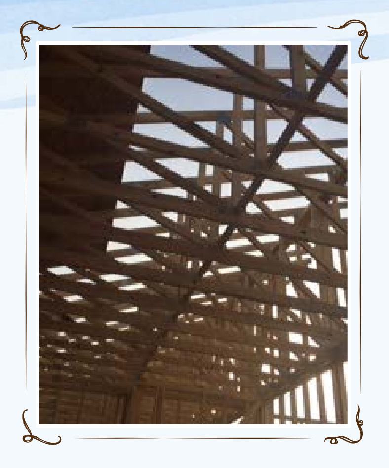
Almost ready to deck before adding the roof.