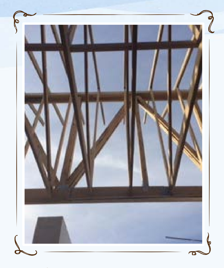
The trusses going up.