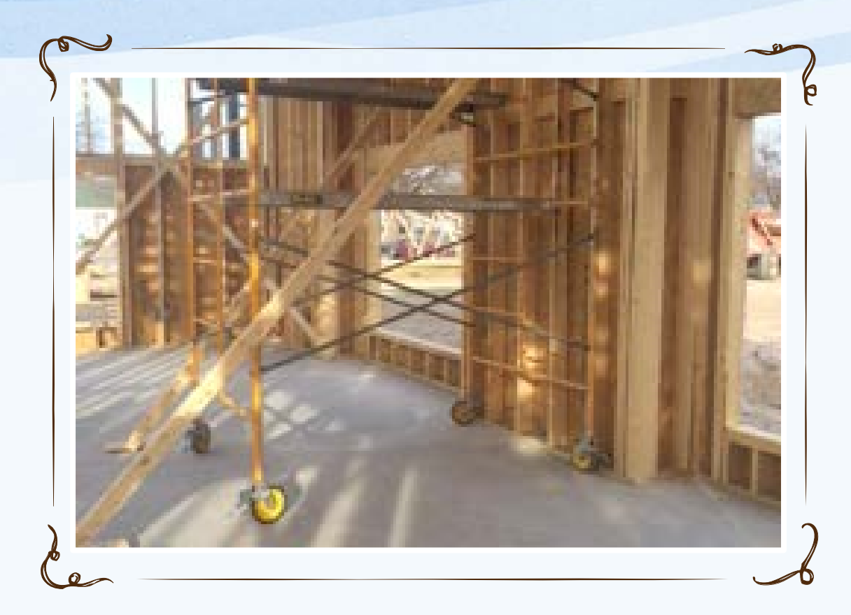
Classrooms before windows and roof