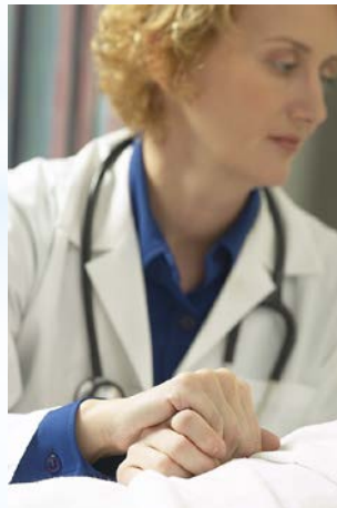
Certified Nurse Aide